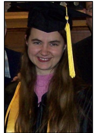
THE NEW GRADUATE!