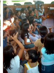
Children's Team '09

VBS NOTE: I forgot to mention that the whole country took two weeks vacation because of an H1N1 "outbreak." One of those weeks was VBS week! Coincidence??