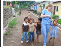
Medical Team '09